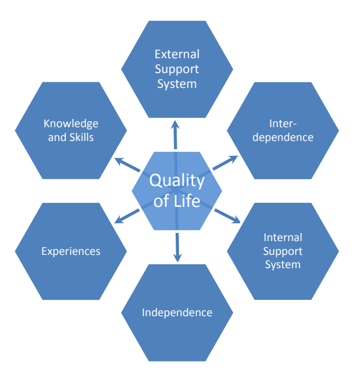
Figure 4.1 Major quality of life themes. The six themes, external support systems, interdependence, internal support systems, independence, experiences, and knowledge and skills, are inter-related. For example, experiences which contribute to quality of life both necessitate independence and help build independence.

In the above configuration, six hexagons, each labeled with a theme, have been arranged in a circular pattern so that each hexagon is adjacent to two other hexagons. This arrangement represents one way to understand the interrelation of the major themes. Knowledge and skills is positioned between external support system and experiences , because external support system and experiences contribute to and are influenced by knowledge and skills . Experience is positioned between knowledge and skills and independence . Independence is positioned between experiences and knowledge and skills . Internal support system is positioned between external support system is positioned between external support system and internal support system . External support system is positioned between knowledge and skills and inter-dependence . The arrows in the center of the circular arrangement of hexagons indicate that there exist many additional relationships among these major themes; this particular relationship was chosen to illustrate some of the stronger relationships based on my own understanding of the data and themes; additional research is needed to better understand these relationships. The term "Quality of Life" in the center of the figure conveys that all themes are connected with this core concept.